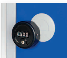
4 digit mechanical combination lock with master key override facility